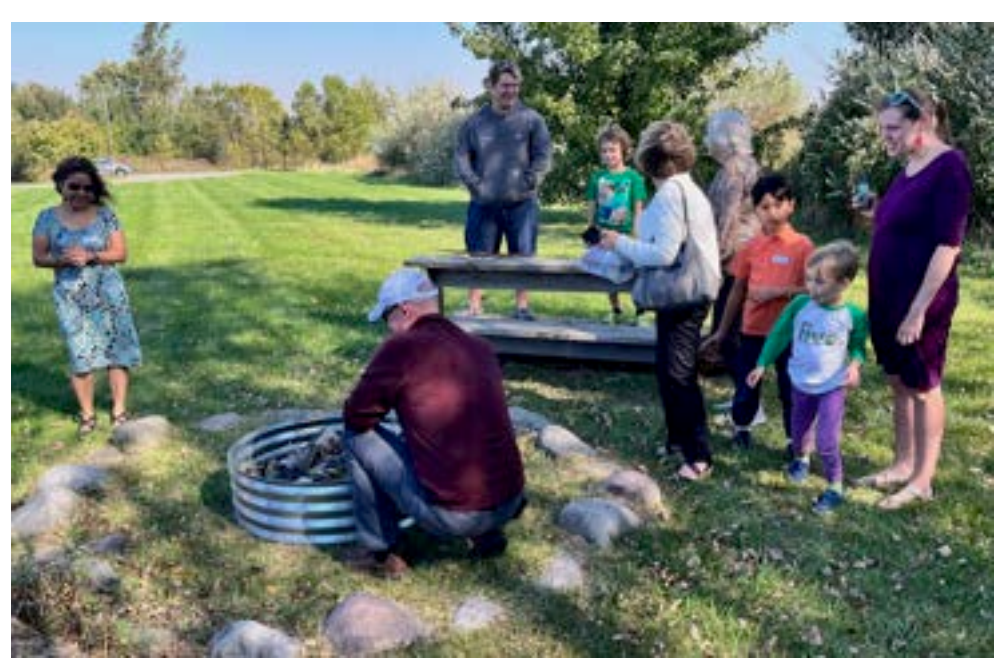
Burning the Mortgage!

A celebration of blessing as we prepare to burn the mortgage.