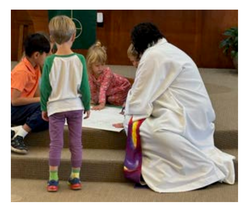
Drawing our hands during the Children's Sermon as we learn about God's Work Our Hands.

After church we share a catered meal by Lake Effect Kitchens