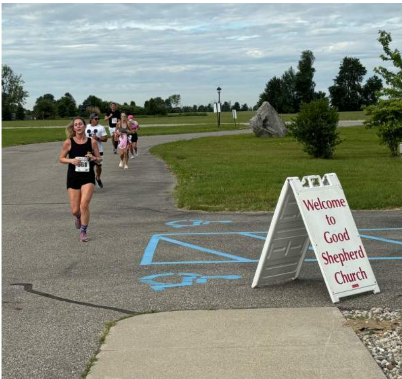
Runners arriving at the water station.