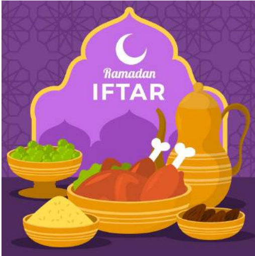
Filiz Dogru - one of the two outside coordinators for our Iftar.