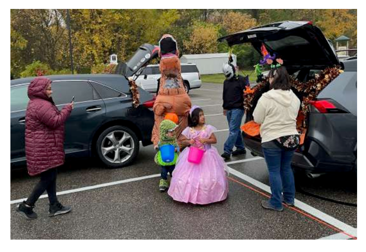
Just a few of the 100 + kids that came to the Trunk or Treat.