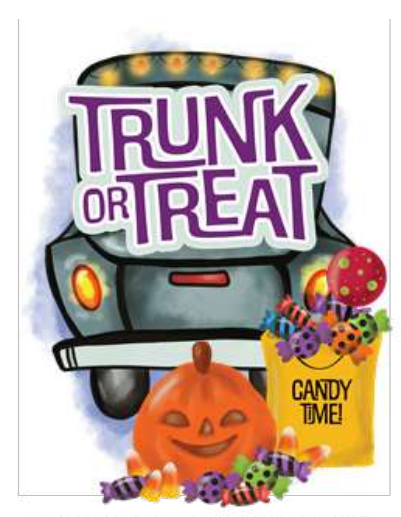
JOIN US FOR OUR TRUNK OR TREAT!