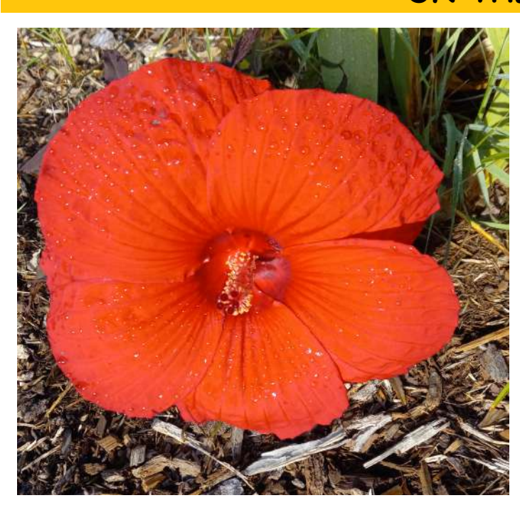
A red hibiscus, about 9 inches across, found in our garden on September 13.

Our Dogwood tree has set its buds for next spring. When the leaves start dropping, we'll be able to find any seeds.