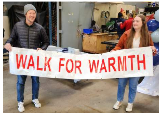
Two Action Agency Volunteers

Thank you to everyone that participated in the Walk For Warmth, held March 4, 2023. The weather cooperated this year with no snow on the ground and decent temperatures.